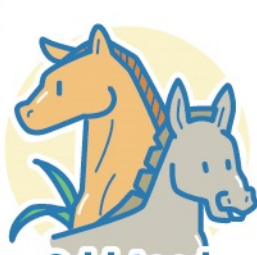
Odd-toed ungulates horse, donkey