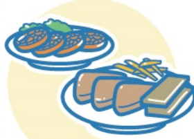
Organ, black pudding, blood sausage