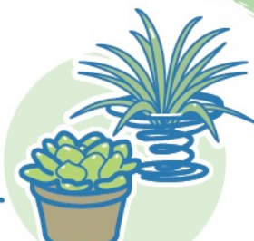
Plants succulent plants, Tillandsia