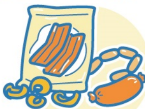
Jerky, sausage, ham, bacon, fried pork rind

These contain meat! Maximum NT$one million fine for bringing to Taiwan!