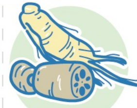
Rhizomes ginseng, sweet potato, lotus root