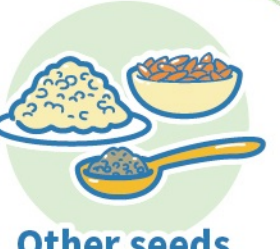
Other seeds quinoa, chia, flaxseed