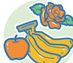
Flowers and fruits fresh flowers, fruits