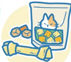
Frozen pet jerky, rawhide