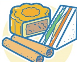
Pastries containing meat, sandwich, pork floss egg roll, mooncake