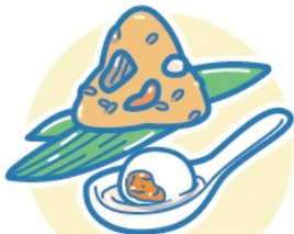
Meat dumpling, tangyuan containing meat