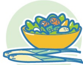
Vegetables salad, lemongrass

Fines for bringing processed or sprout-capable fresh items to Taiwan!