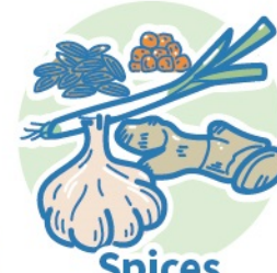
Spices scallion, ginger, garlic, spices with seeds

Dry-looking plant products can still sprout and root.