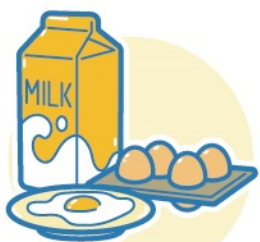
Fresh milk, raw egg, semi-cooked egg

Not just meat! Be careful of other animal products!