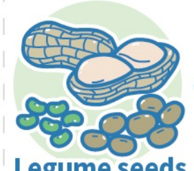
Legume seeds peanut, black bean, mung beans