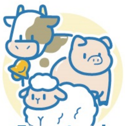
Even-toed ungulates pig, cattle, sheep, deer

Not just pork! All poultry and meat products are regulated!